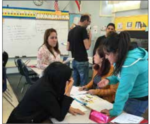
ESL students in class

The citizenship preparation class offers adults interested in becoming a US citizen, the opportunity to learn more about the history and the government of the United States. Students are preparing for the USCIS Oral Interview, as they study to improve their English reading, writing, and speaking skills.