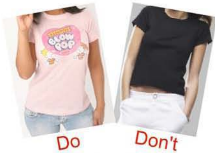
No bare midriffs.