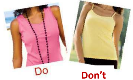
Shirts must have shoulder straps.