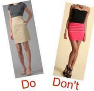
Skirts must be longer than fingertip length.