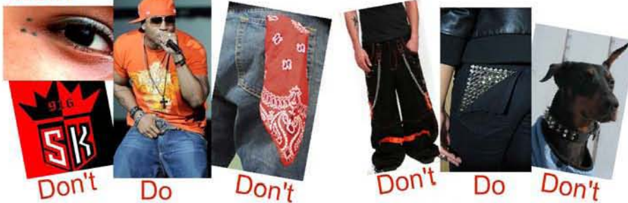
No advertising gang affiliation, e.g. bandanas, doo rags, 916, etc.