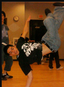
Join a club...