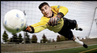
Sports & Recreation