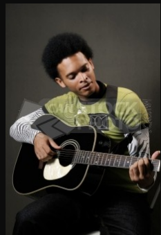
...or start your own